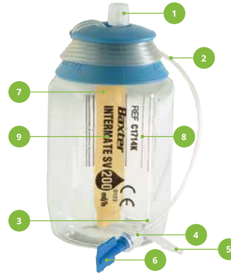
Small Volume Intermate