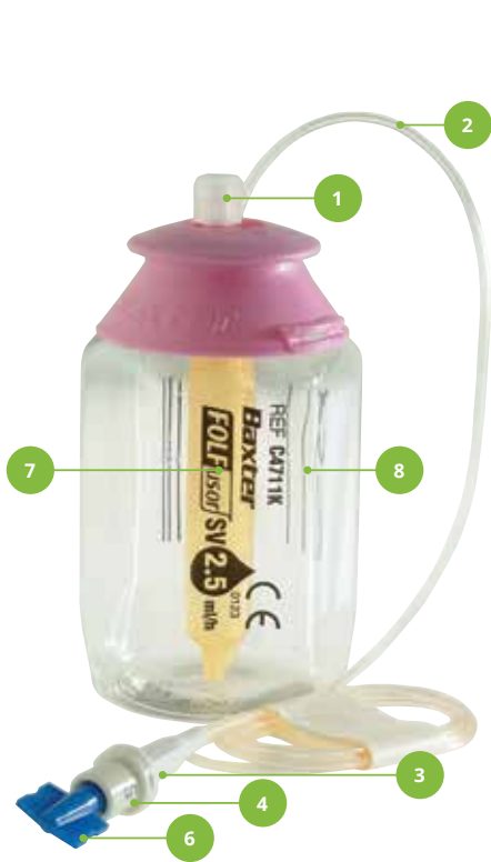
Pūwhakawai SV Hoto-takitahi Rere-Pōturi