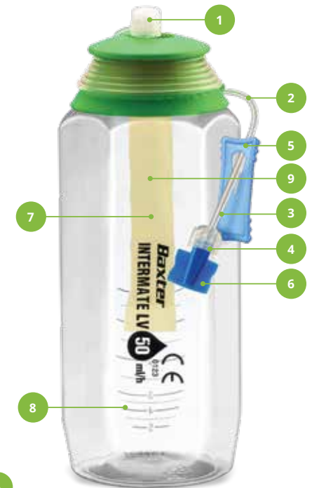
Large Volume Intermate