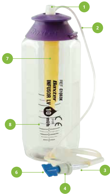
Pūwhakawai LV Hoto-takitahi Rere-Pōturi